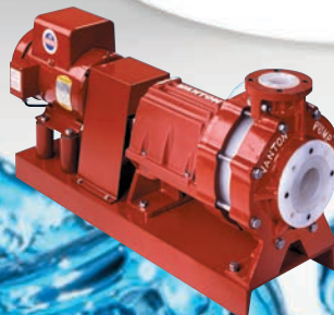
Chem-Gard® Horizontal Centrifugal Pumps