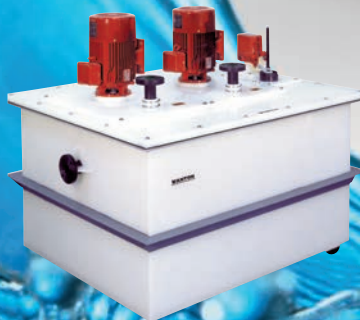
Pump/Tank Non-metallic Systems