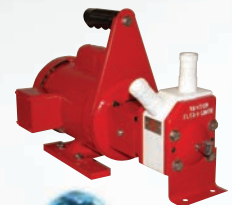
Flex-I-Liner® Rotary Peristaltic Pumps